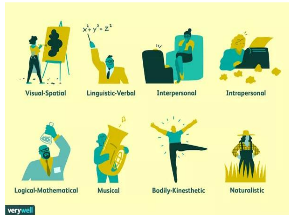
Illustration by JR Bee, Verywell